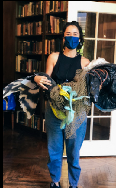
The Mermaid tail on set