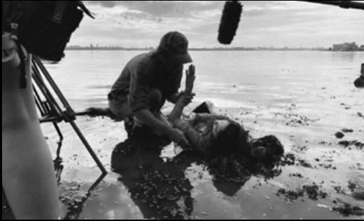
Shooting in Flushing Bay, Queens