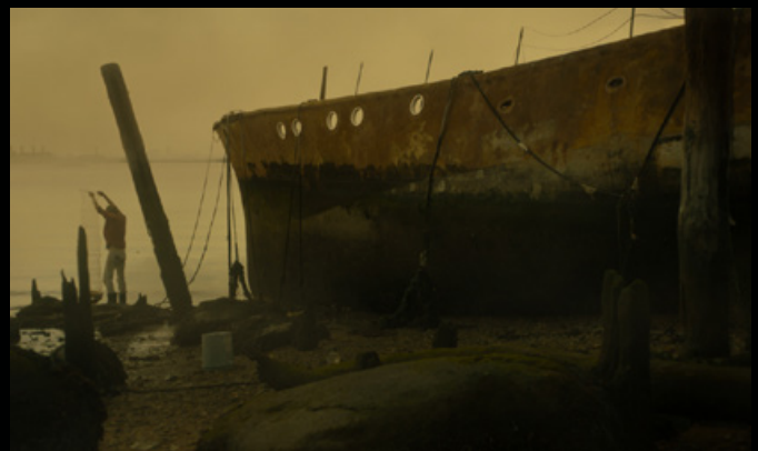
Final scene with VFX and color grade

What will our world look like when the ecosystems collapse, droughts ravage our cropland, and wildfire smoke chokes out the sun? We used VFX techniques like set extensions, object removals, and compositing to imagine this post-apocalyptic wasteland. We then used real world, contemporary examples of smog and industrial pollution for our color grade, to suggest that this nightmare reality is much closer than we'd like to admit.