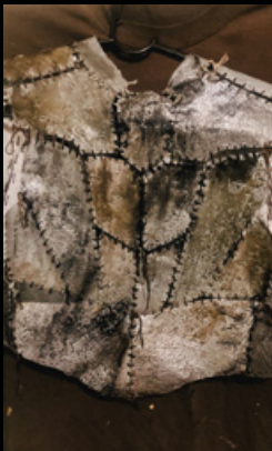
Painted and weathered