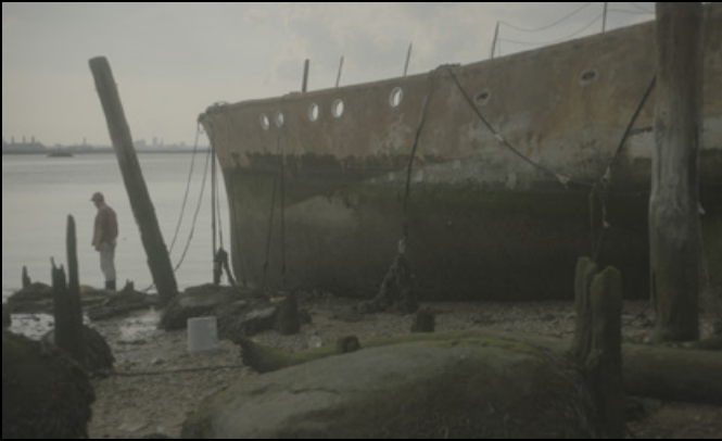
Scene as captured in camera