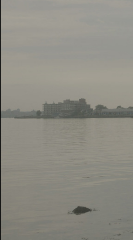
Scene as captured in camera