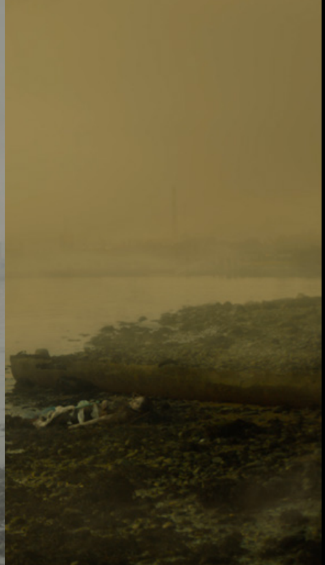
Final scene with VFX and color grade

What will our world look like when the ecosystems collapse, droughts ravage our cropland, and wildfire smoke chokes out the sun? We used VFX techniques like set extensions, object removals, and compositing to imagine this post-apocalyptic wasteland. We then used real world, contemporary examples of smog and industrial pollution for our color grade, to suggest that this nightmare reality is much closer than we'd like to admit.