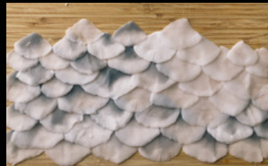
Silicone cast from clay sculptures