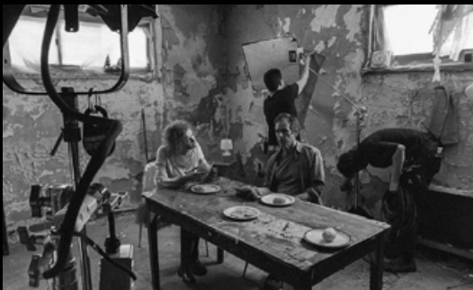
On set at the Andrew Freeman Home in the Bronx