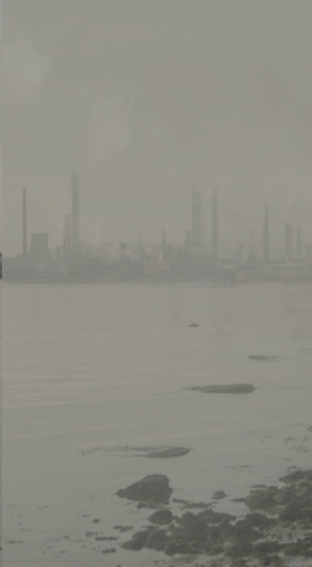
Industrial set extension and smog composited in