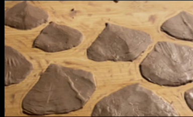
Scales sculpted in clay