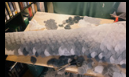
Tail assembled with scales