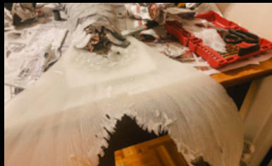
Plastic resin cast from clay sculpture