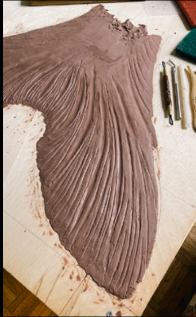
Tail fin sculpted in clay